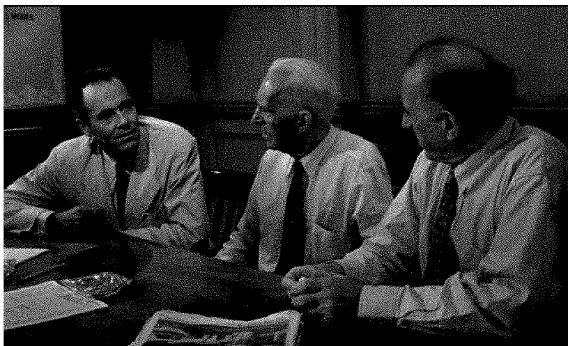
Juror #8 (Henry Fonda) argues for a reasonable doubt in 12 Angry Men . 12 ANGRY MEN (United Artists 1957).

Juror #8: Well, it could mean a lot of things. Could mean he didn't want the case, or he resented being appointed. It's the kind of case that brings him nothing, no money, no glory, not even much chance of winning. That's not a very promising situation for a young lawyer. He'd really have to believe in his client to put up any kind of a good case and as you pointed out a minute ago, obviously he didn't. 178