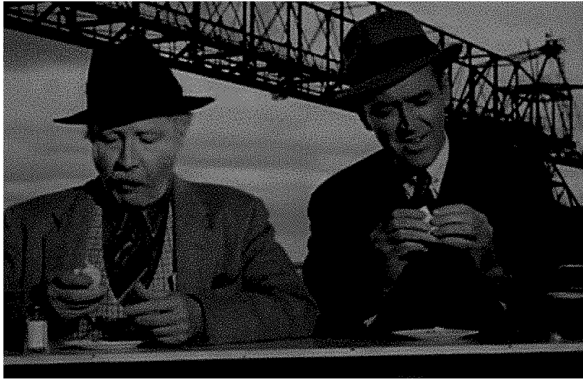
McCarthy (Arthur O'Connell) challenges Biegler (James Stewart) to take Manion's murder case in Anatomy of a Murder over lunch, suggesting that Biegler's hesitance might be the result of his fear of losing the trial. ANATOMY OF A MURDER (Columbia Pictures 1959).

Biegler, apparently spurred on by McCarthy's challenge, returns to the jail to interview Manion where he explains the legal theories for defense in murder cases and further explains why Manion cannot rely on the first three: that someone else committed the crime; that it was an accident; or that the act was justified. 284 When Manion claims the "unwritten law" justifies the murder of another who has raped his wife, Biegler responds, "The unwritten law's a myth, Lieutenant. There is no such thing . . . and anyone who commits a murder on the theory that it does exist has just bought himself room and board in the state penitentiary, maybe for life." 285