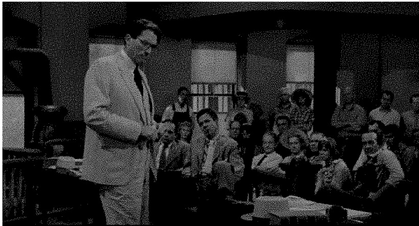
Atticus Finch (Gregory Peck) argues Tom Robinson's innocence in closing argument. TO KILL A MOCKINGBIRD (Universal Int'l Pictures 1962).

Unfortunately for his innocent client, Atticus Finch's beautifully scripted and delivered closing argument fails to persuade the jury, which likely turned on Tom Robinson because of his expression of pity for Mayella Ewell, his accuser. 20